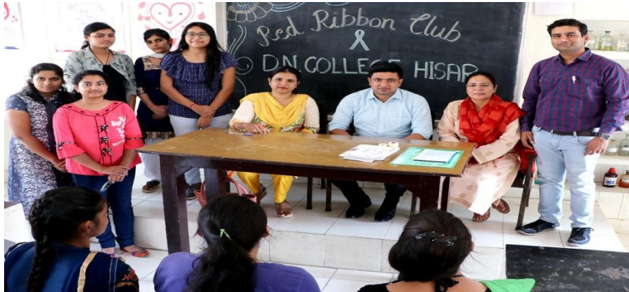
Promotion of toll free number