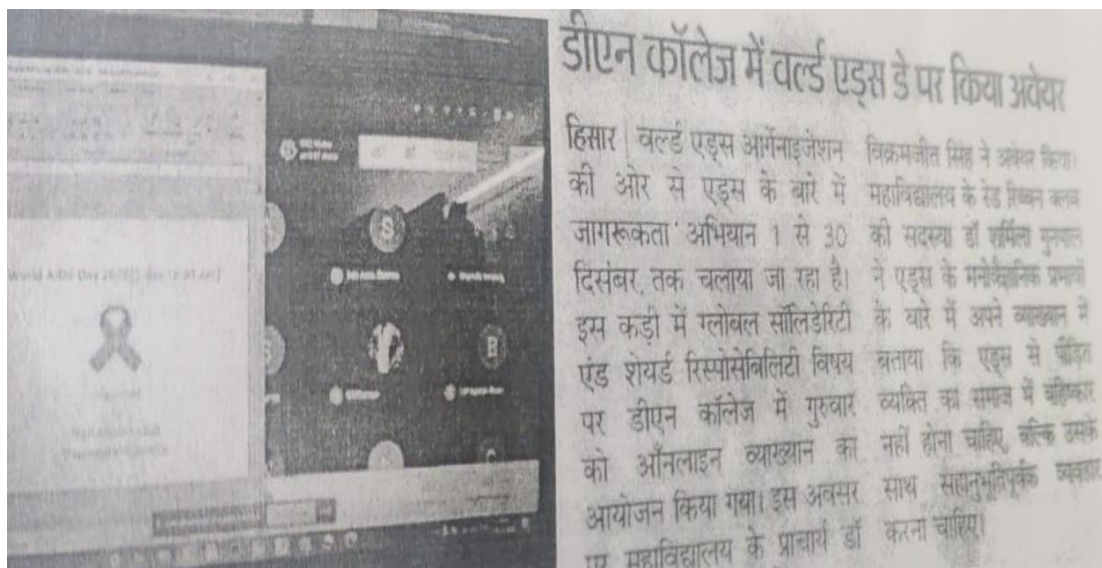
An online lecture regarding HIV AIDS