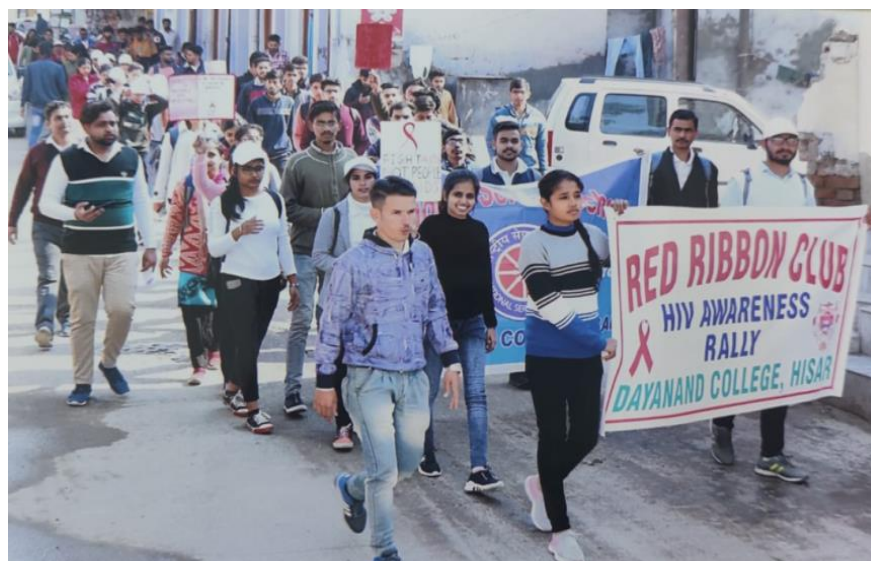
HIV awareness rally