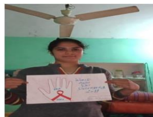
Poster Making Regarding HIV/AIDS.