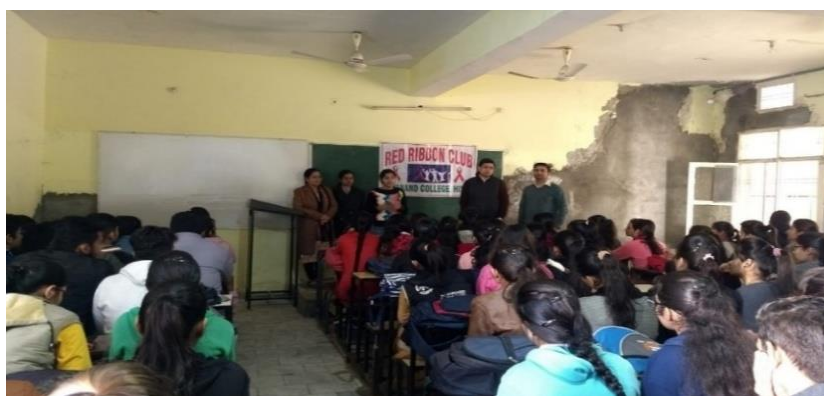
Lecture delivered regarding HIV/AIDS