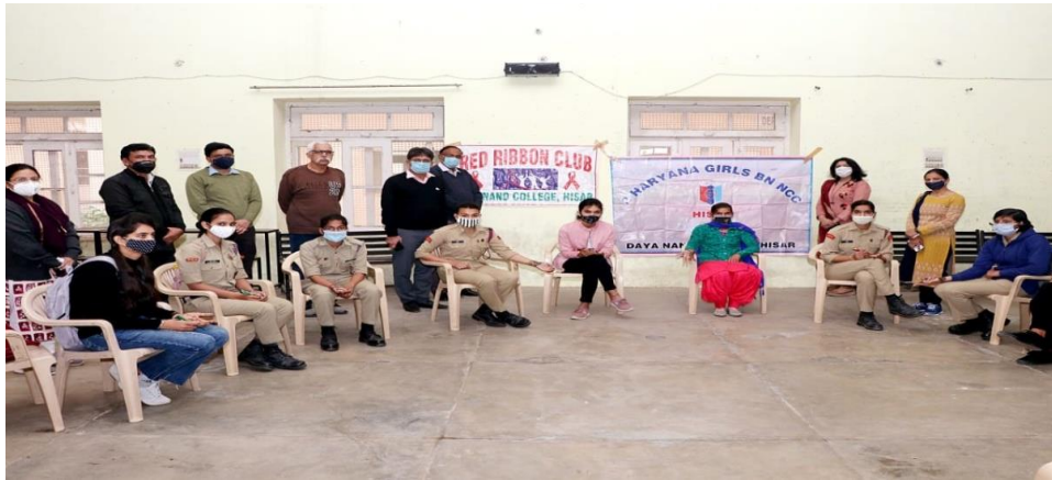
Mehndi Competition at Dayanand college, Hisar