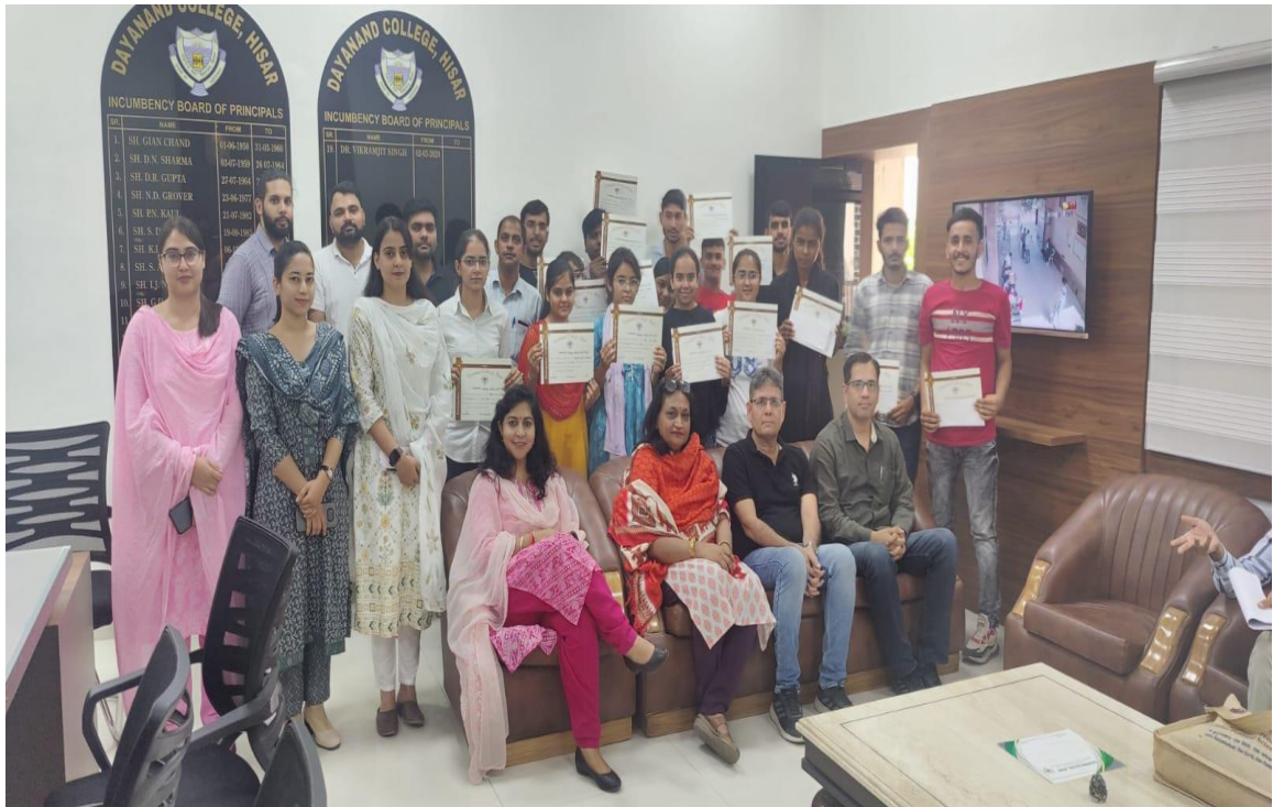
Prize Distribution of Literary Festival