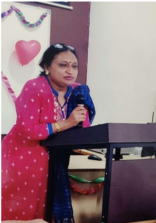
A talk session on Creative Writing and Public Speaking