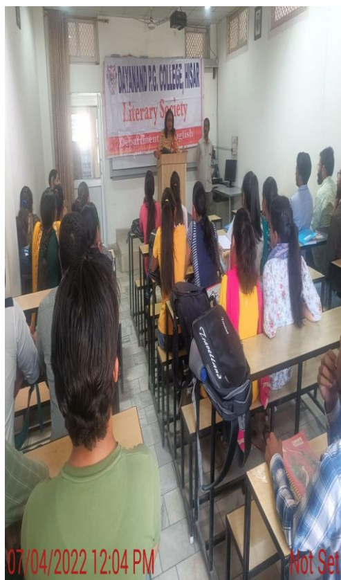
A talk session on the importance of Soft Skills