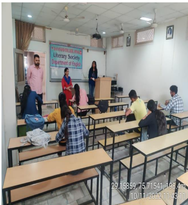
Essay Writing Competition