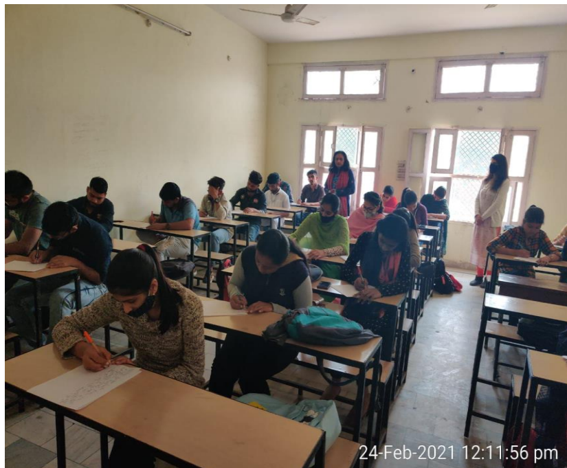
Creative Writing Competition held on 24th Feb 20