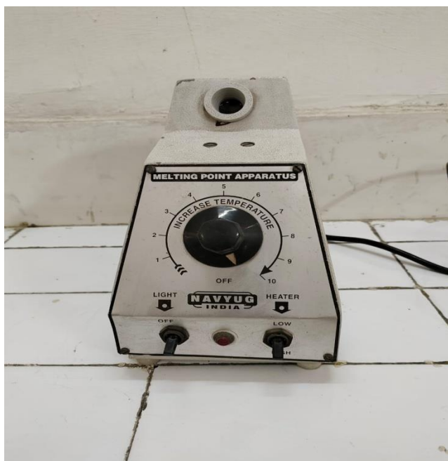
Melting Point Apparatus