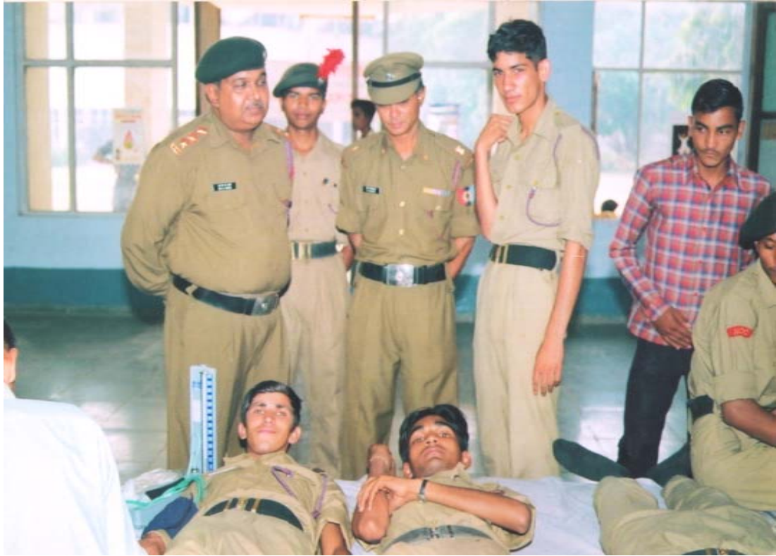
Cadets Donating Blood during Blood Donation Camp