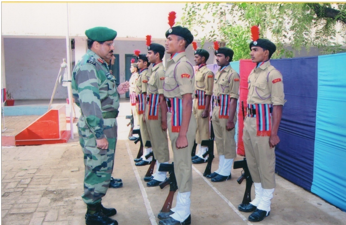
NCC Officer Inspecting the Cadets