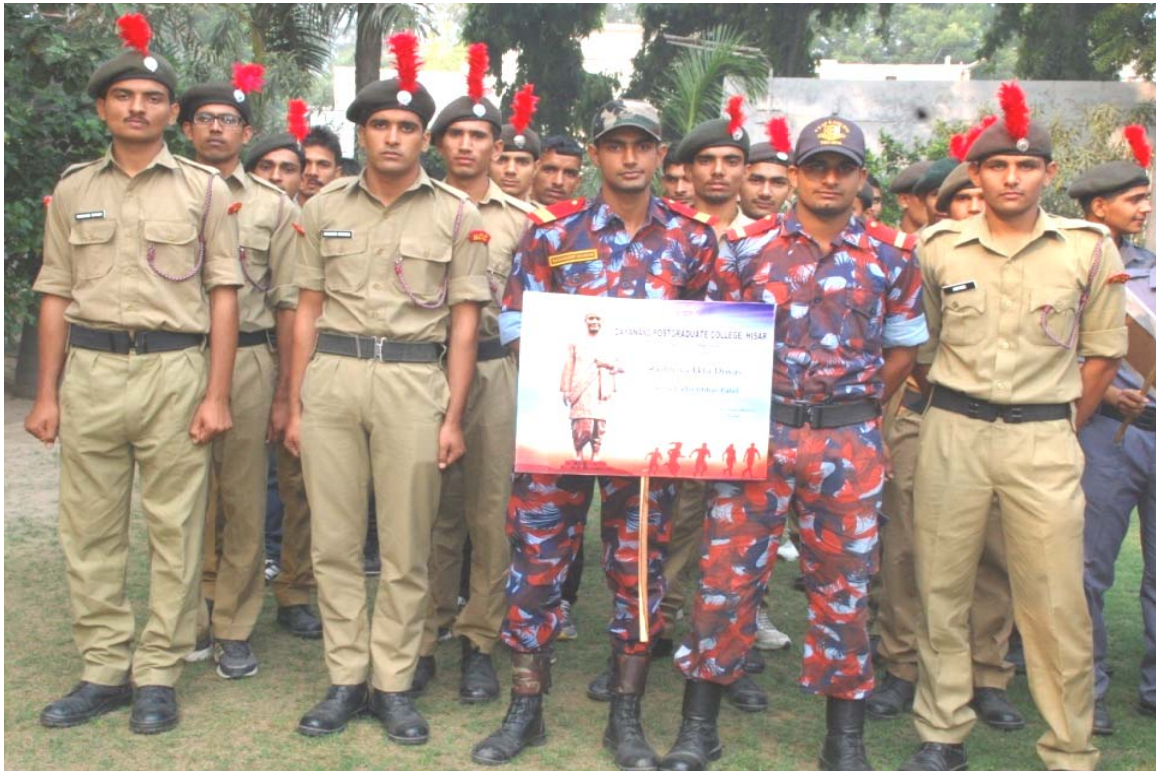
College Cadets Organising National Integration Rally