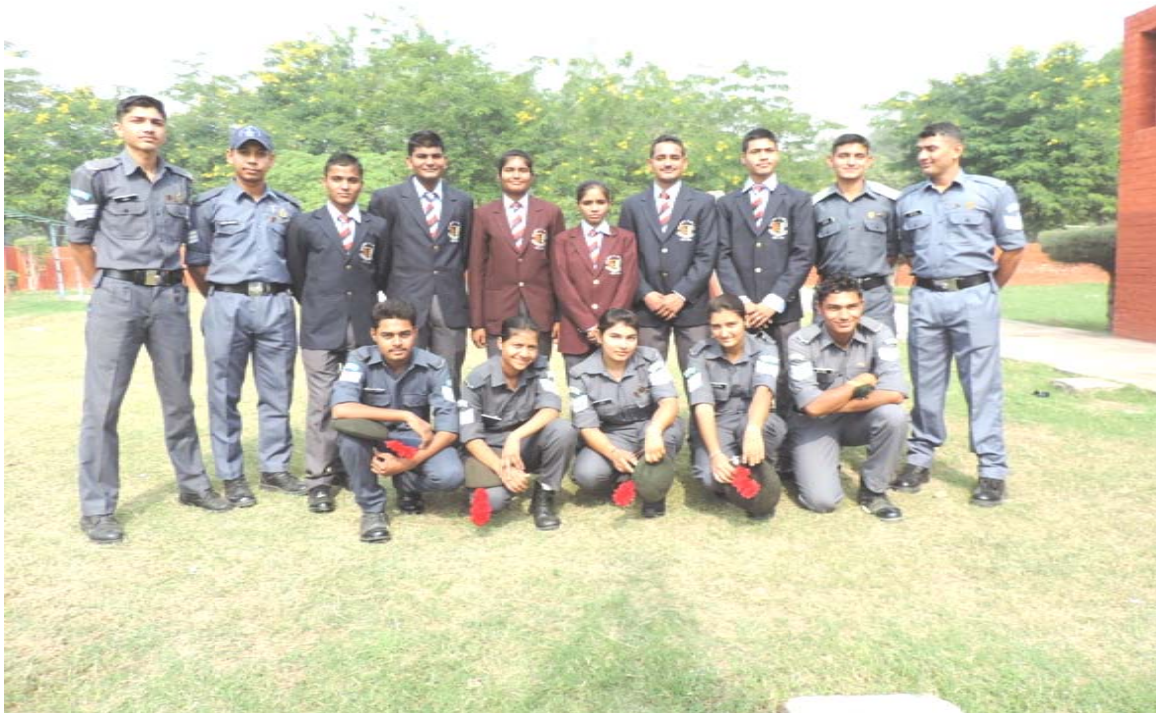
Cadets at Pre Vayoo Sainik Camp