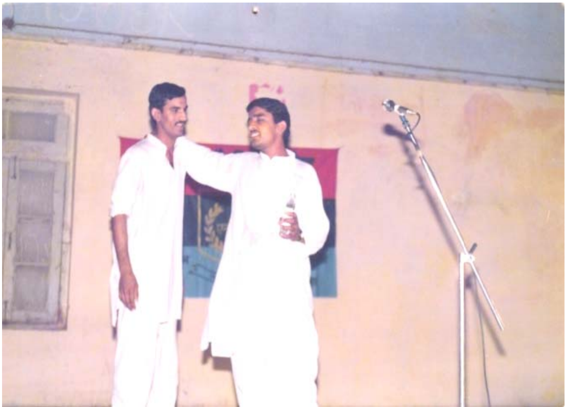
Cadets participating in Cultural Events