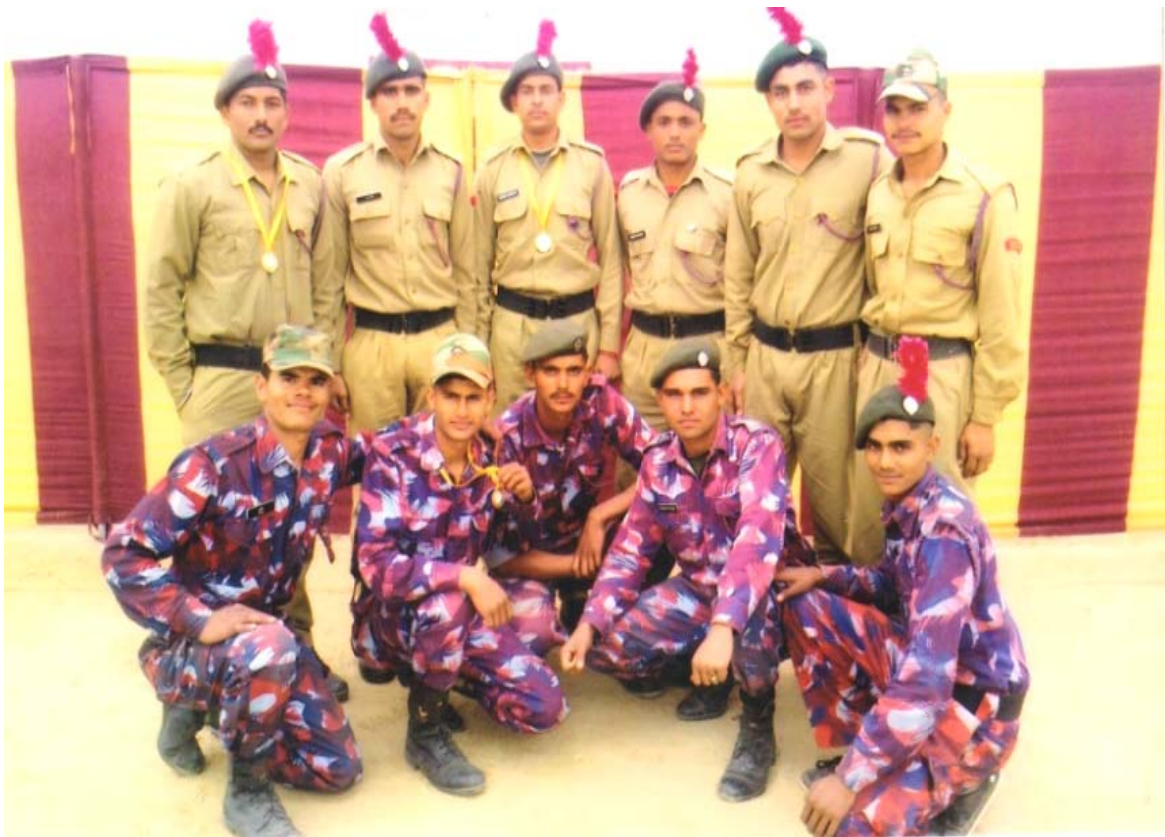
Cadets during Camp