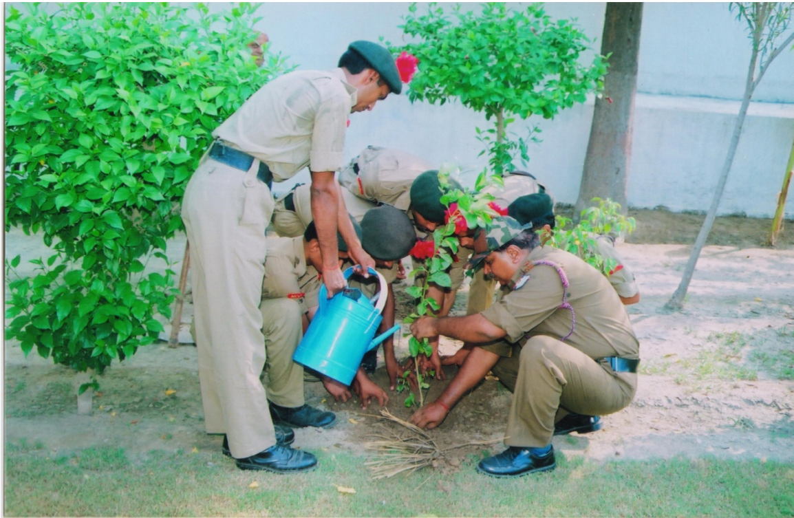
Tree Plantation Drive at College Hostel Campus