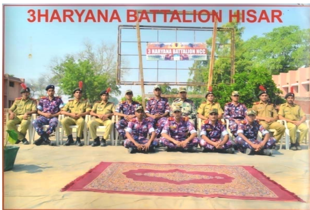
Group Photo of Annual Training Camp