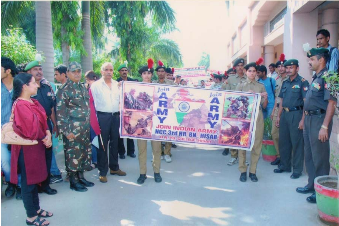
Cadets during Awareness Rallies