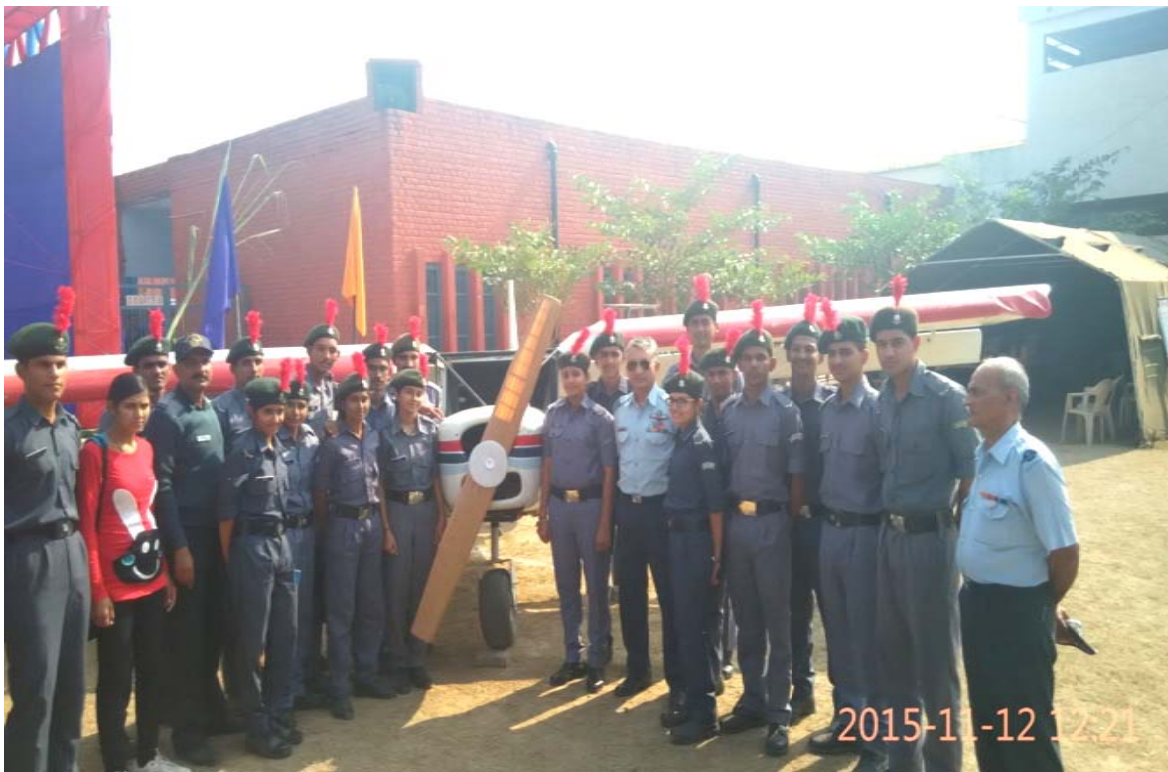
Cadets at Flying Training