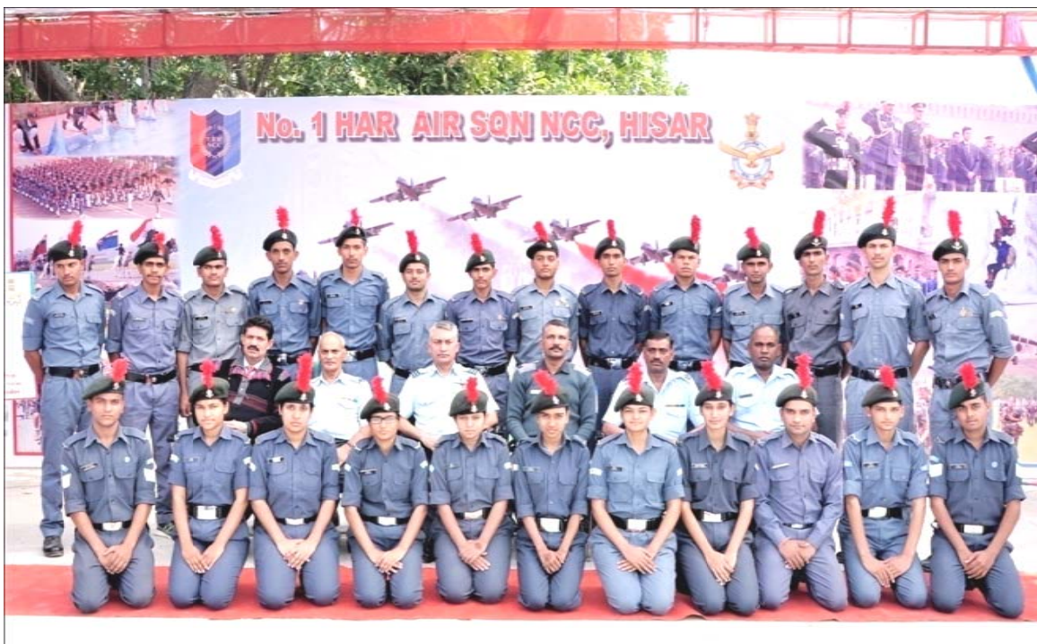
Group photo at Annual Training Camp