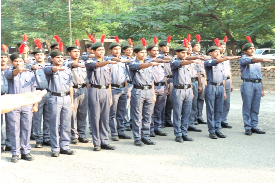
Cadets taking Oath during Annual Training Camp