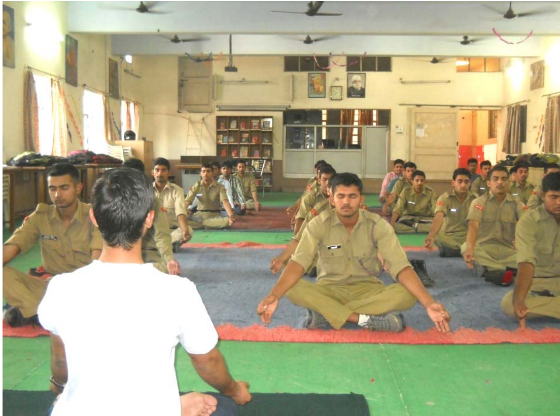
Cadets Celebrating International Yoga Day