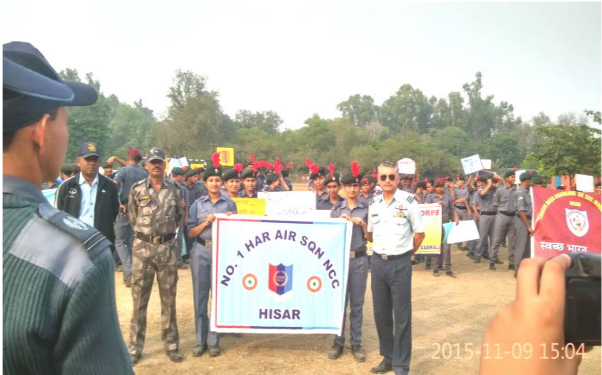
Cadets at Awareness Rally