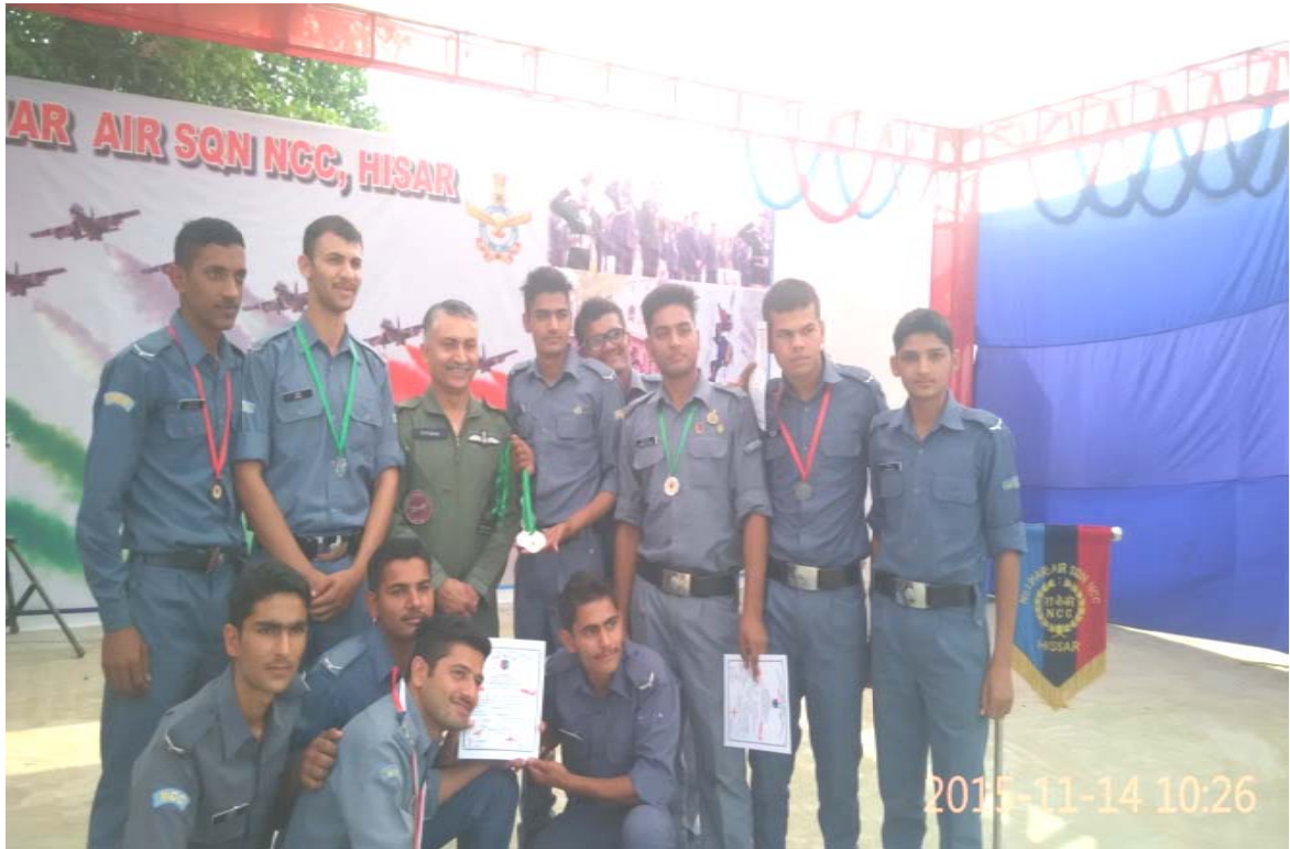
Cadets at Combined Annual Training Camp