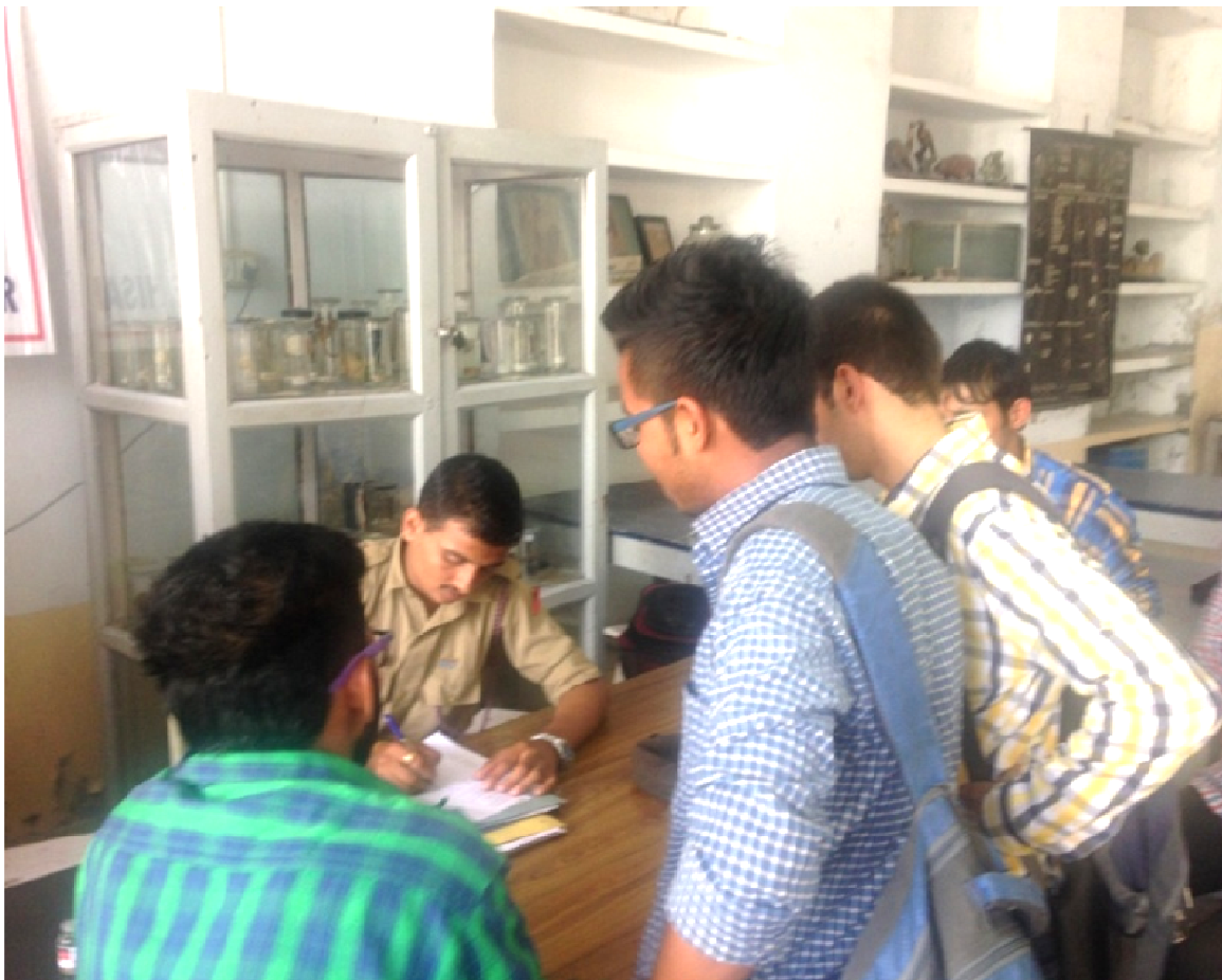
Cadets during Hepatitis B & C checkup camp