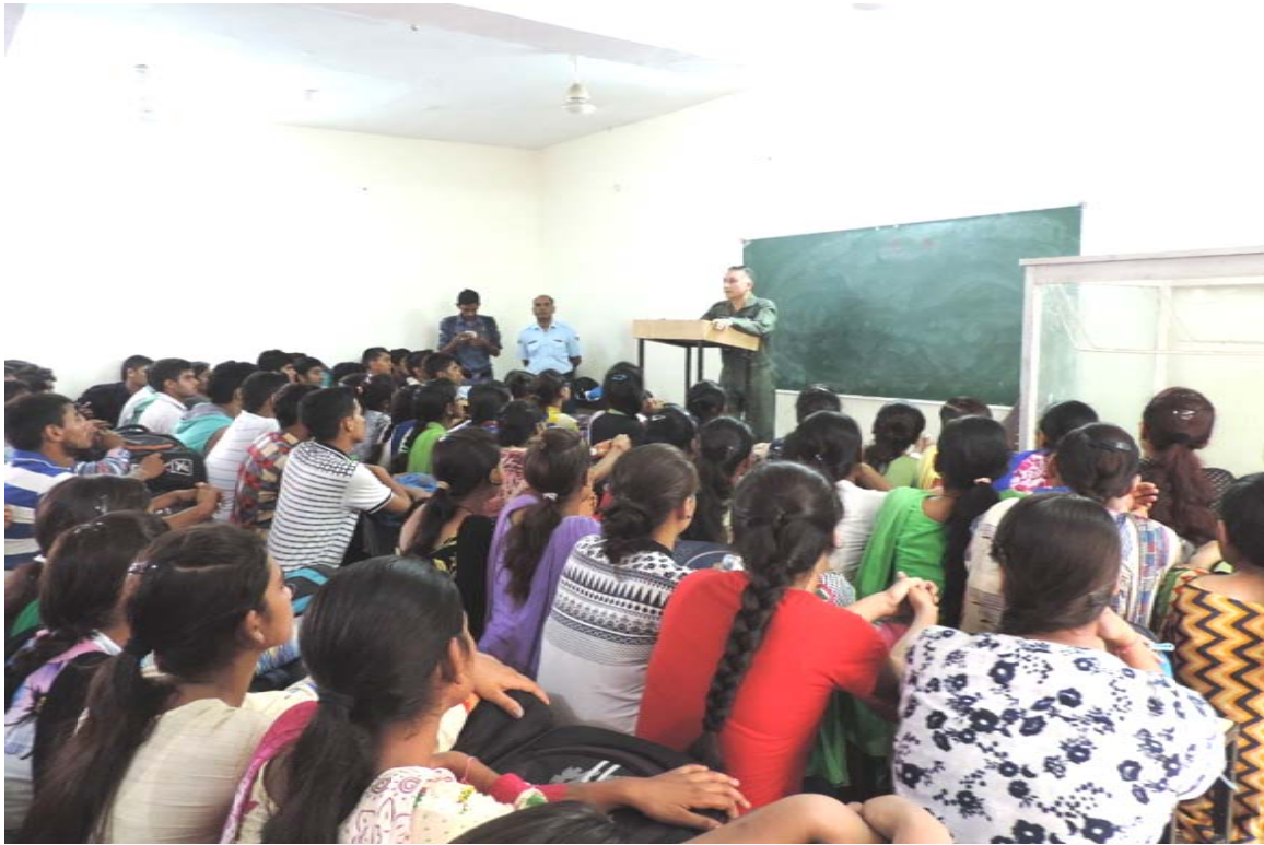
CO Addressing the Cadets