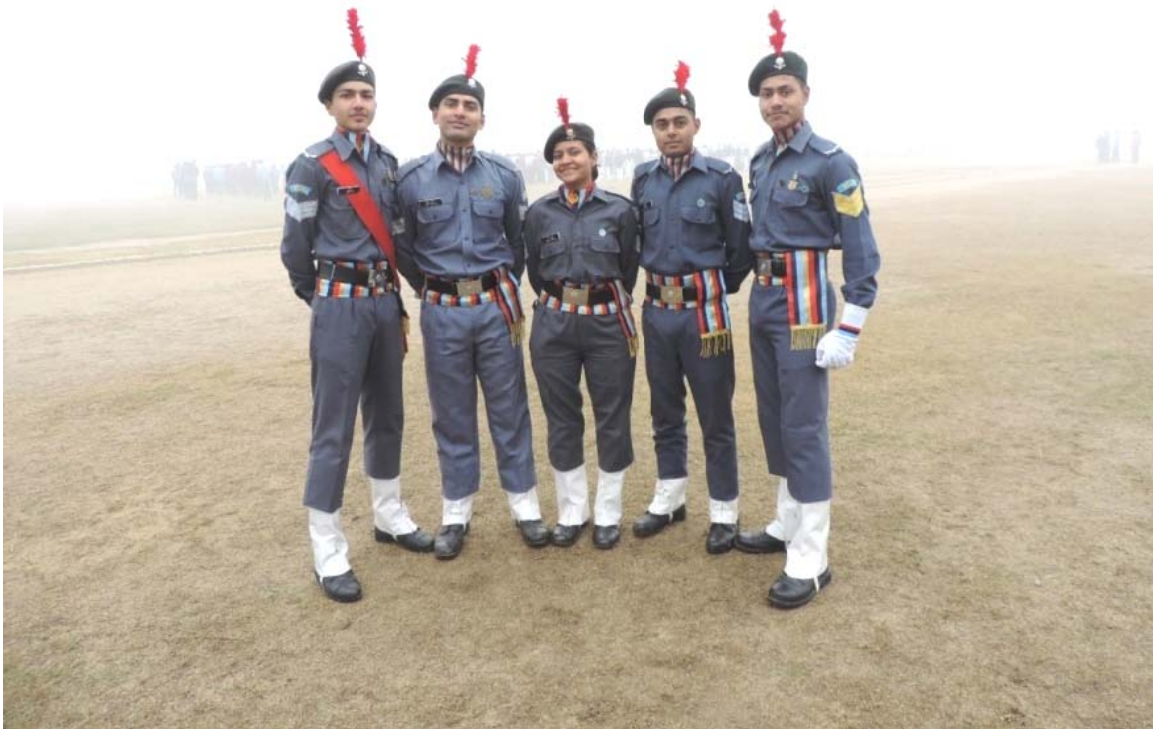
Cadets Participated in District Level Republic Day Parade