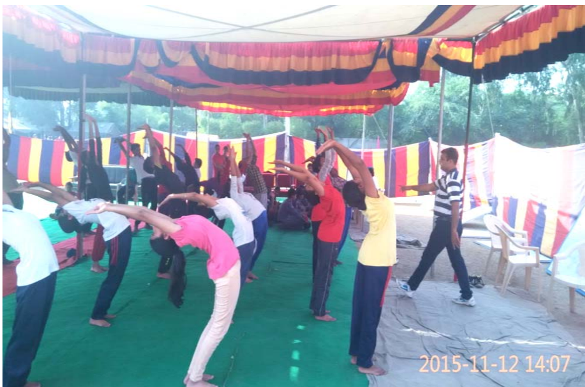
Cadets at Yoga Camp