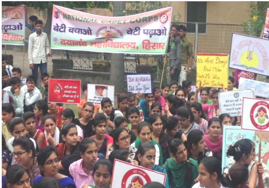
“Beti Bachao Beti Padhao” Awareness Rally by the Cadets