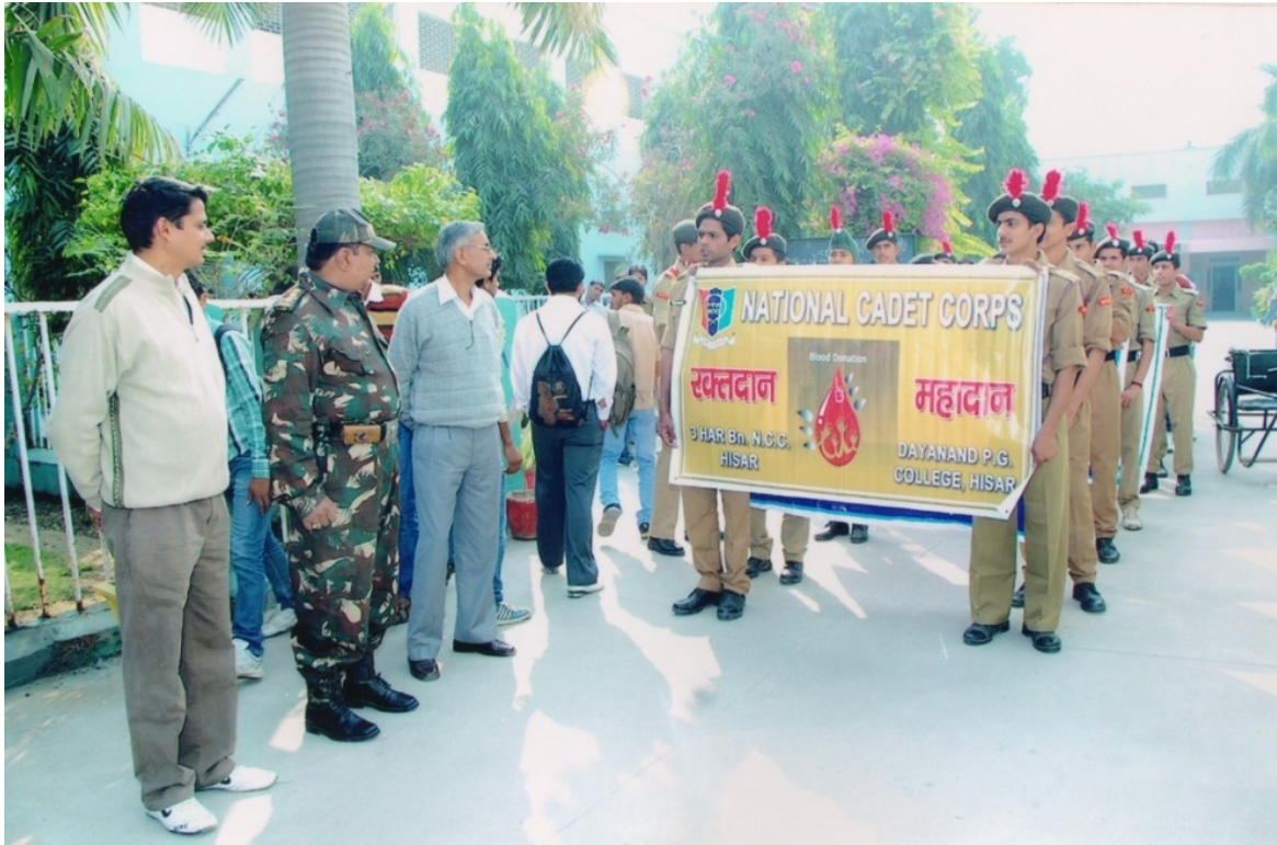
Cadets Spreading Awareness about Blood Donation