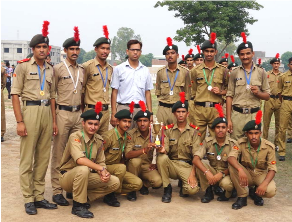
Cadets with the best line layout Trophy