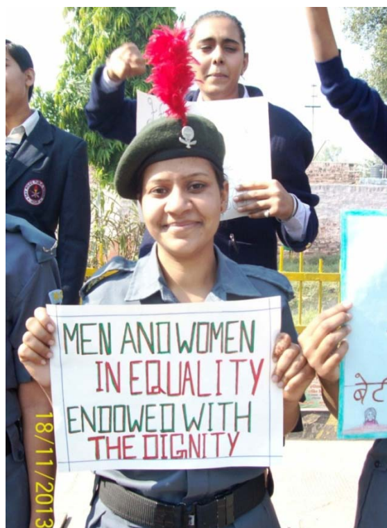
Cadets at Awareness Rally