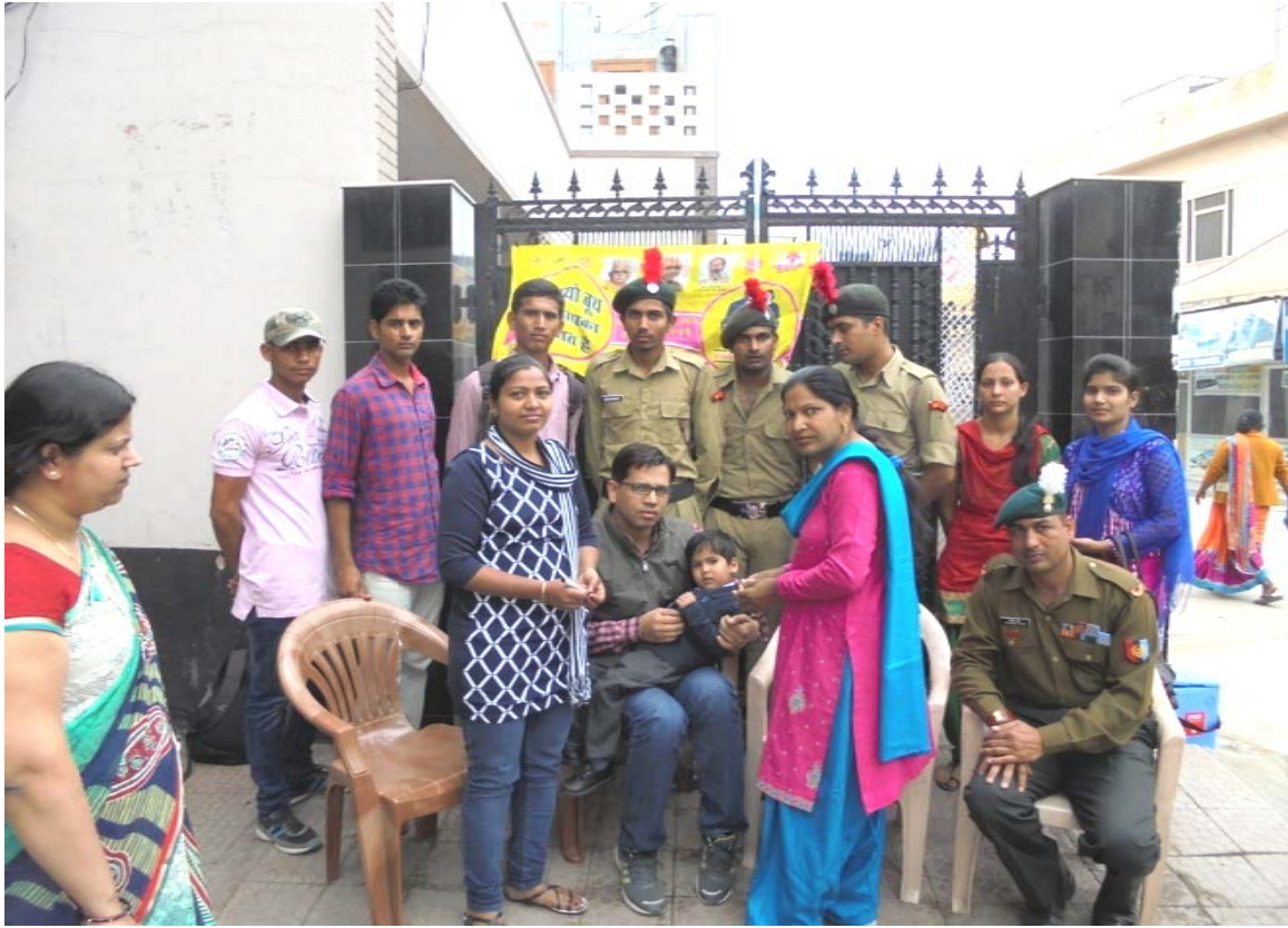
Cadets Participated in Pulse Polio Abhiyaan