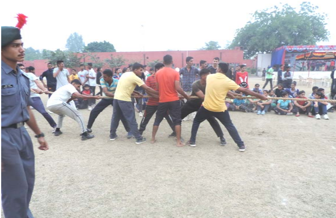
Cadets Participating in Sports Activities