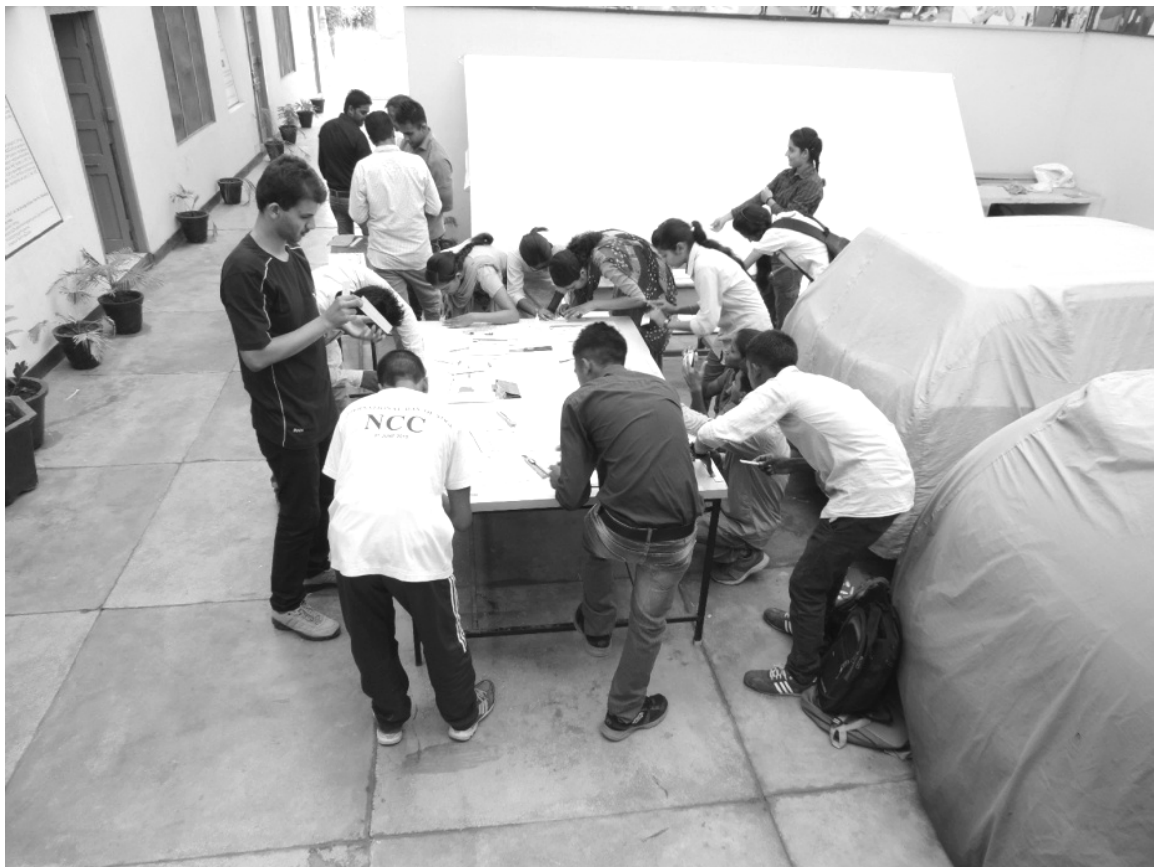
Cadets during Aero Modelling Competition