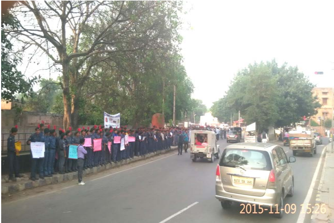
Cadets at Awareness Rally