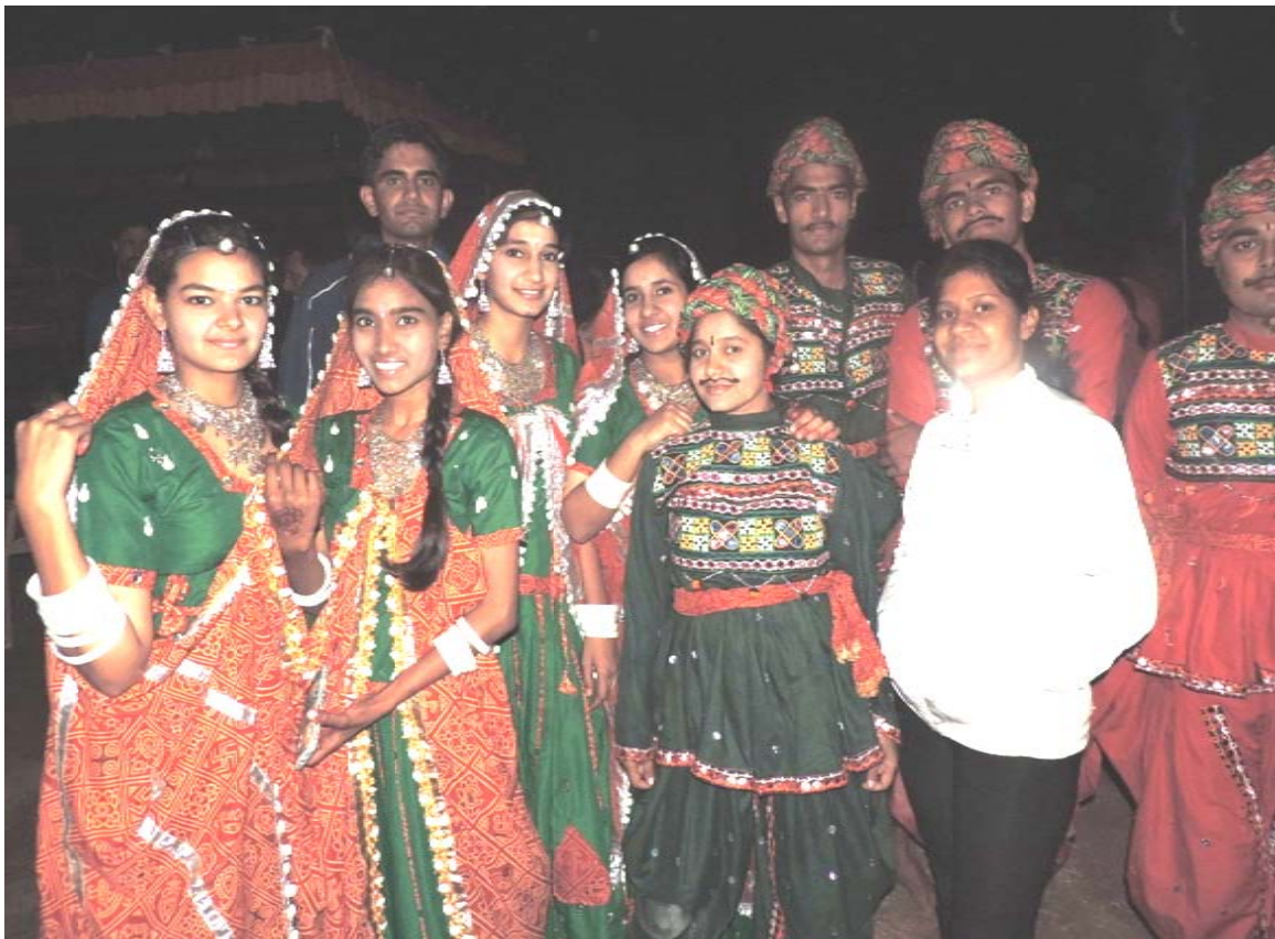
Cadets Participating in Cultural Events