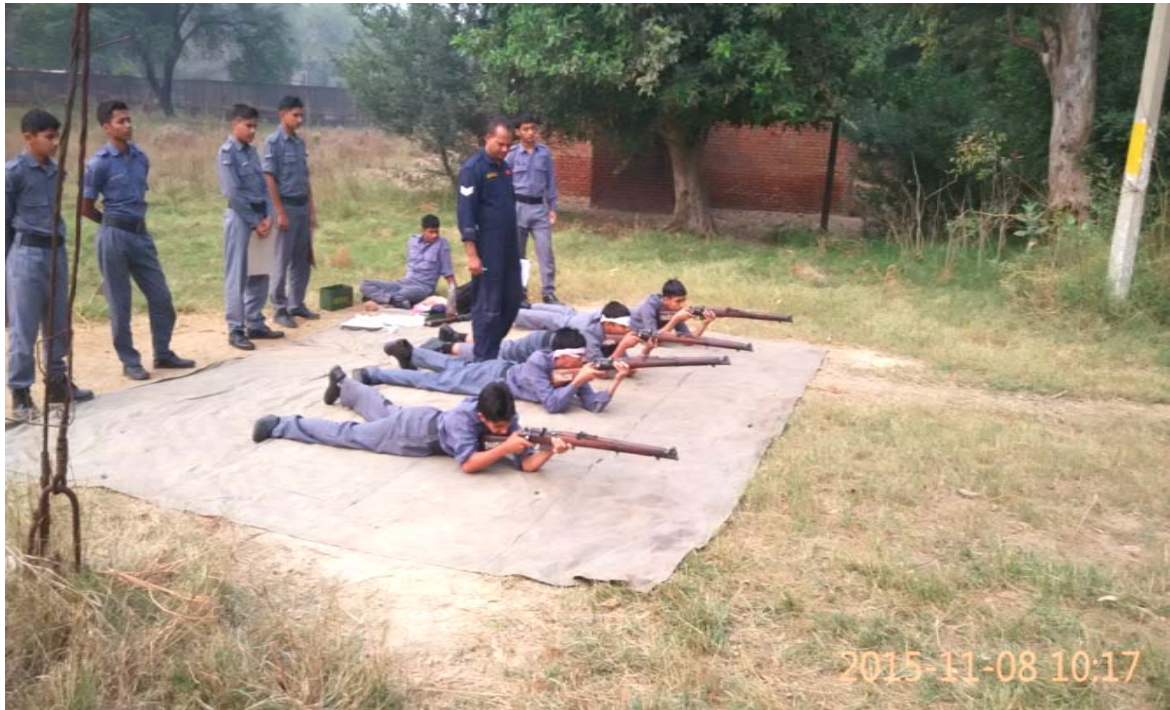
Cadets at Firing Camp