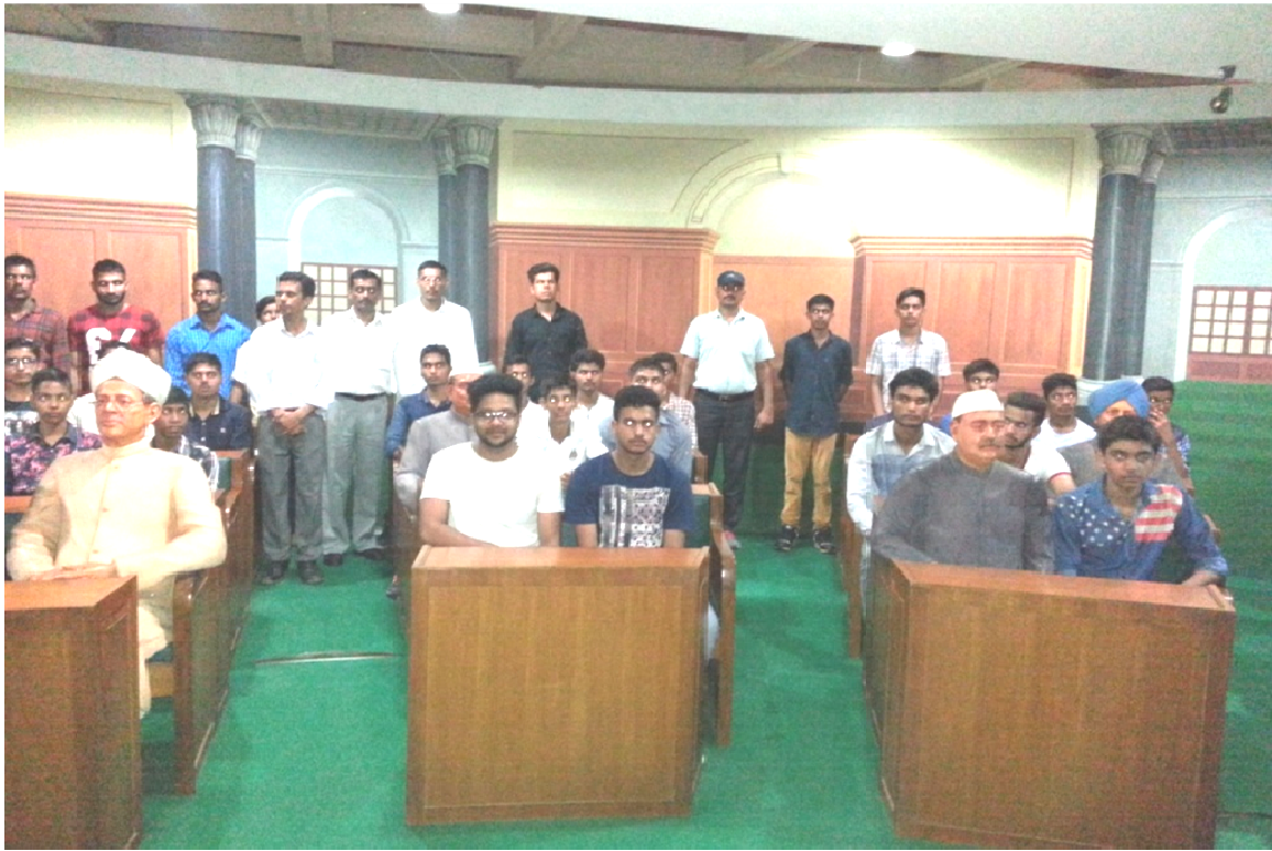
Cadets at Parliament, New Delhi