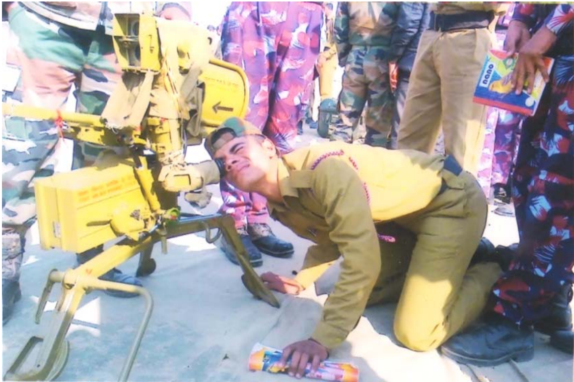
Cadets during Weapon Training Camp