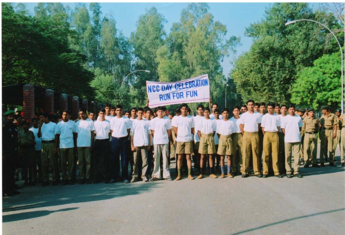
Cadets Celebrating NCC Day