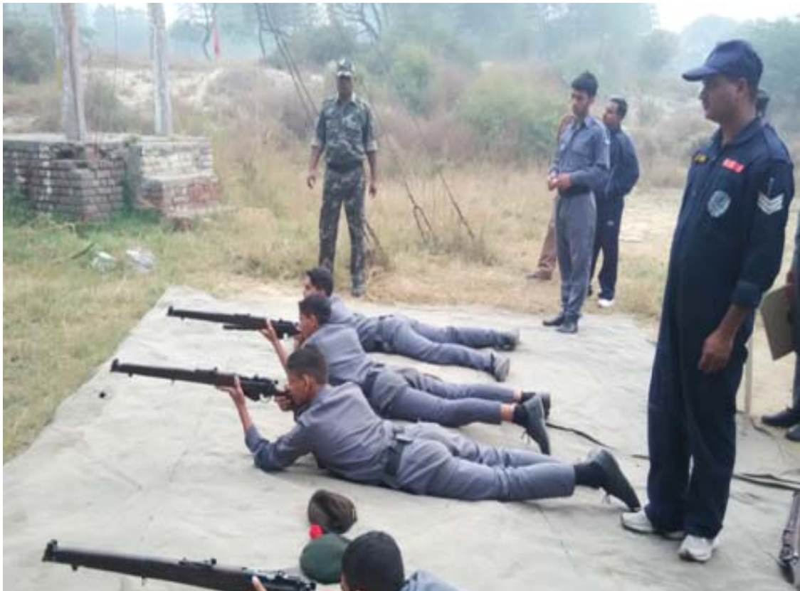
Cadets at Firing Camp