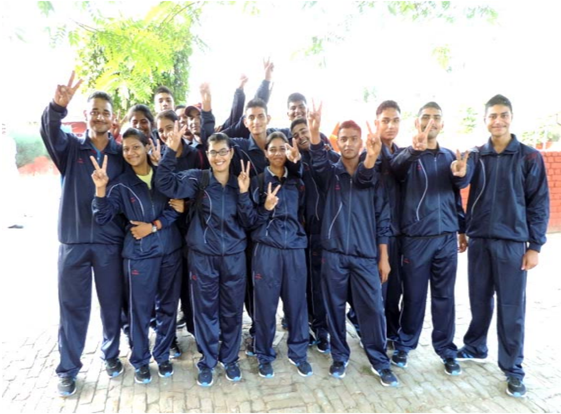
Cadets in AFAC