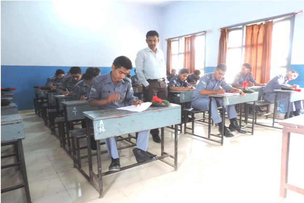
Cadets appearing for “B” Certificate Exam