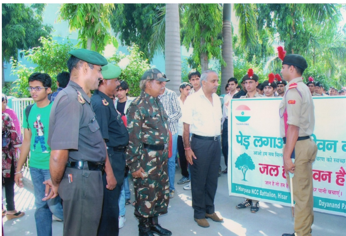
Cadets during Environment Awareness Programme