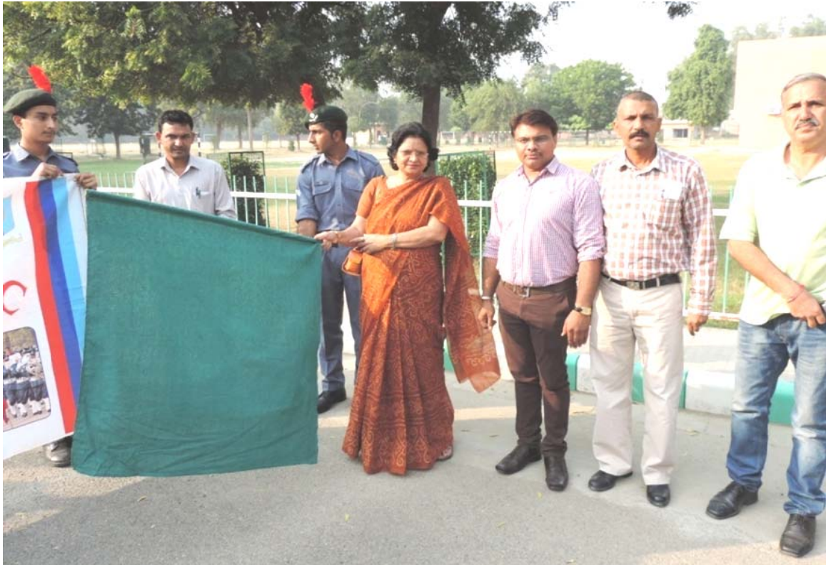
Cadets Participating In Awareness Rally