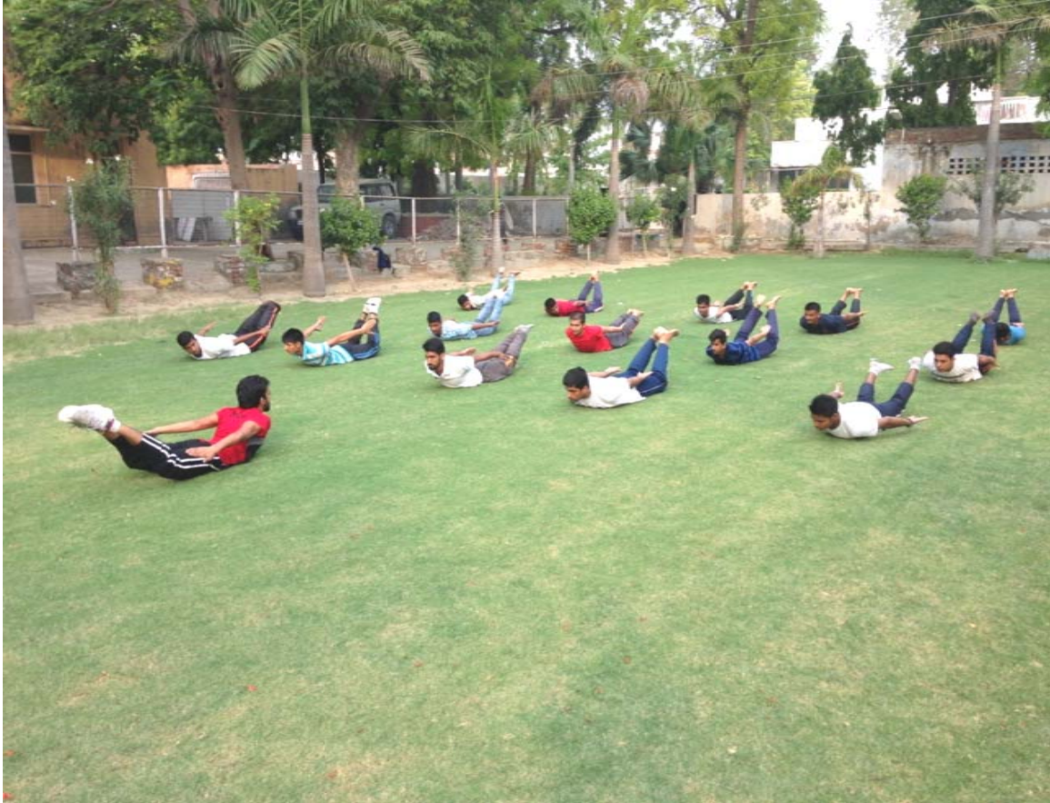
NCC Cadets Celebrating International Yoga Day